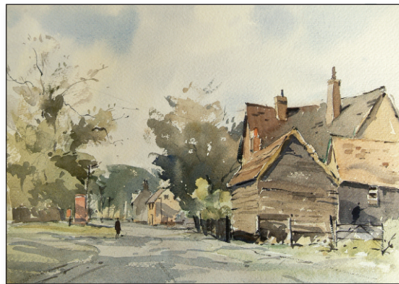
A Morning Stroll, Whittington, near Cheltenham. Watercolour