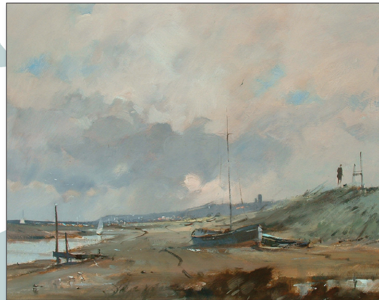
From Morston towards Blakeney. Oil