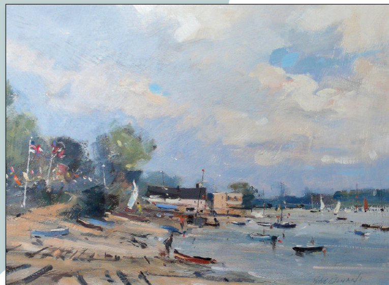
Waldringfield, Suffolk. Oil.