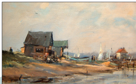
Ferryman's Hut, Walberswick, Suffolk.