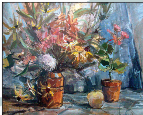
Still Life with Flowers. Oil.